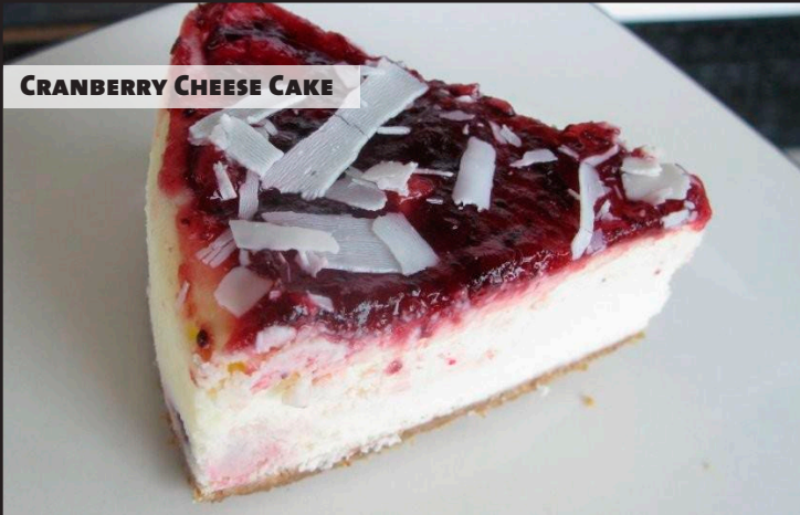
CRANBERRY CHEESE CAKE