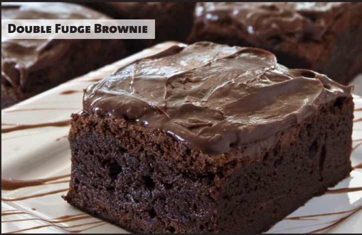
DOUBLE FUDGE BROWNIE